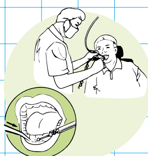
Saline Water Splasher